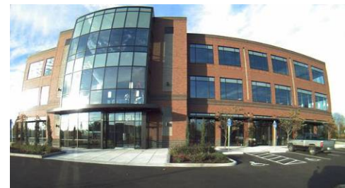
Typical wide angle lens