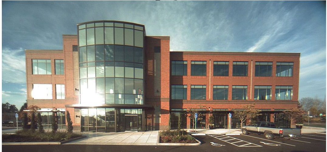
125° without distortion